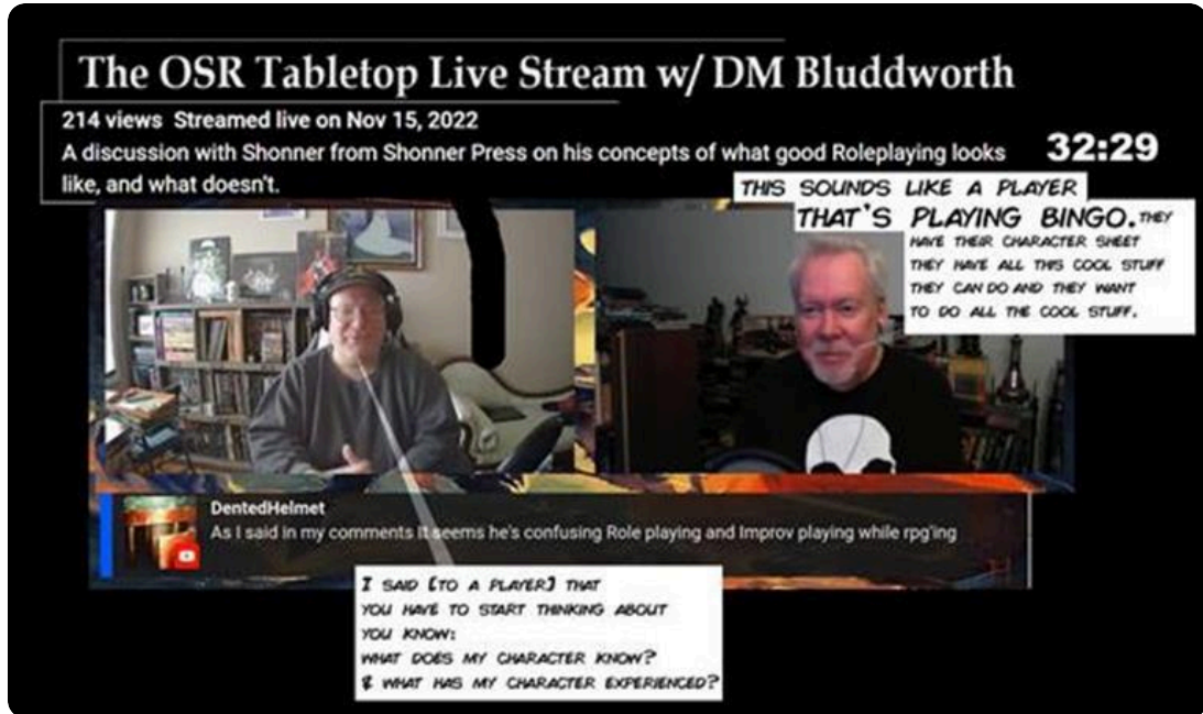
re: superficial players